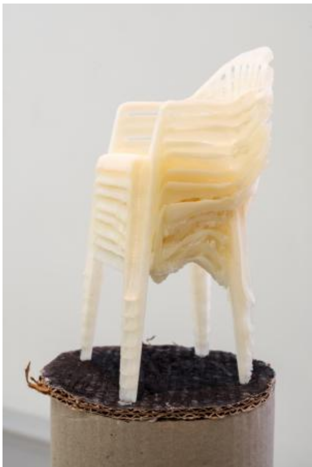
Where We Meet, 2024 PLA, 3d Print, 0.9X15X0.9cm