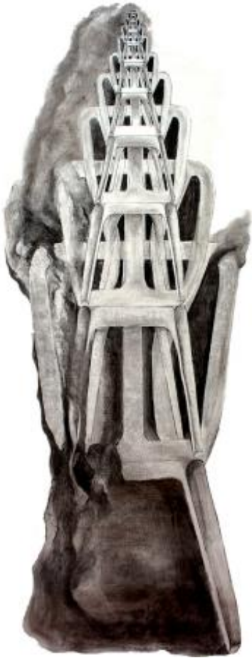
Chairs, 2023 Charcoal on paper, 1.50X3.50M