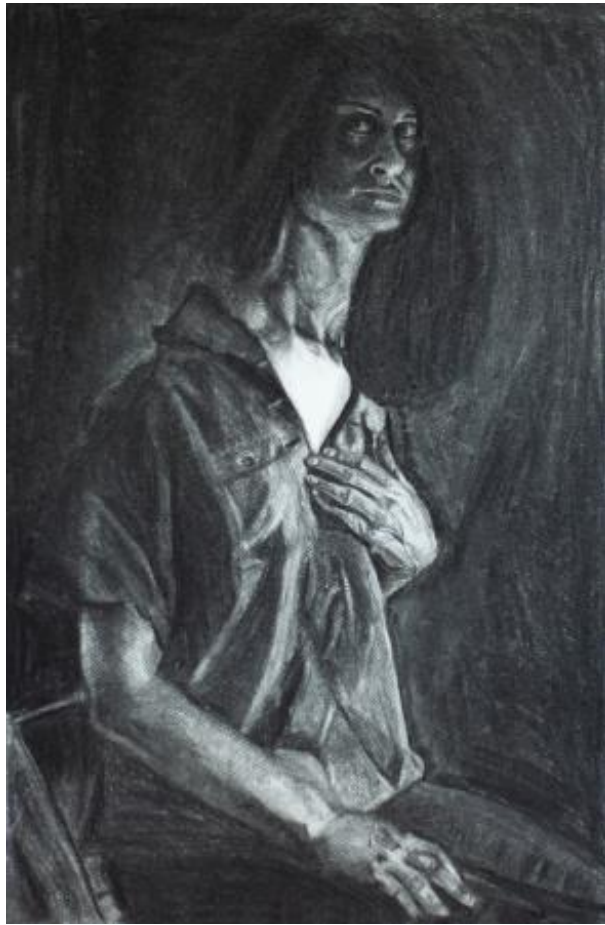
Self Portrait with Blue Shirt, 2021 Charcoal on paper, 50X70cm