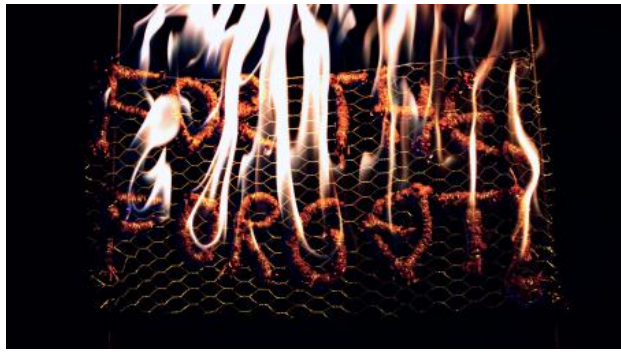
For the, Forget, 2023 Video