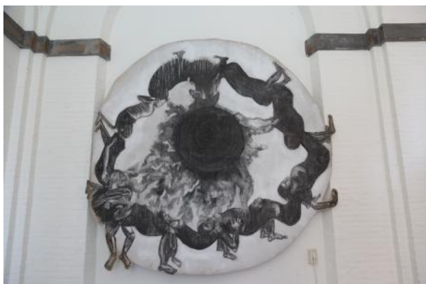
Friendly Fire, 2024 Charcoal on cardboard, 2.10X2.10m