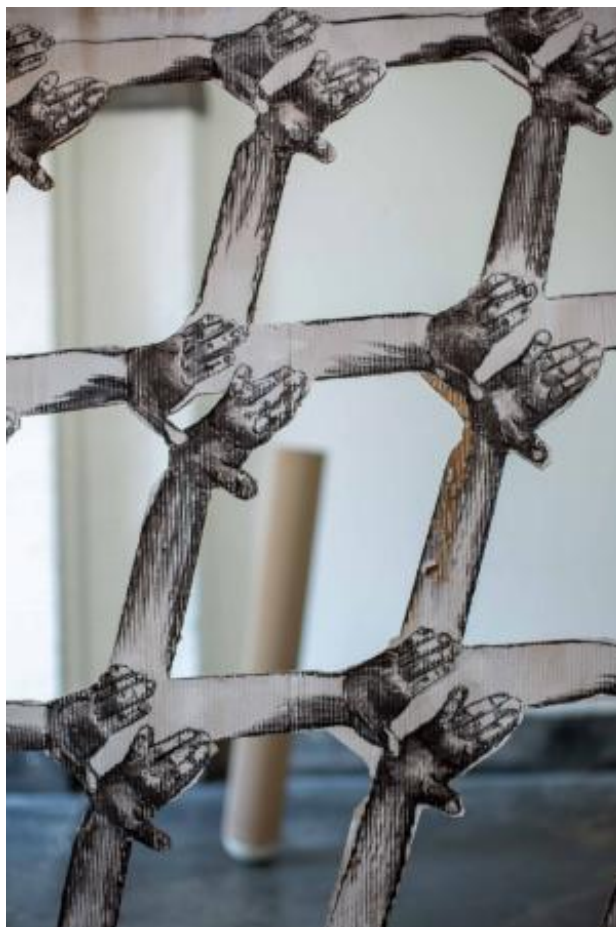
Friendly Fire, 2024 Charcoal on cardboard, 3.30X2.40m