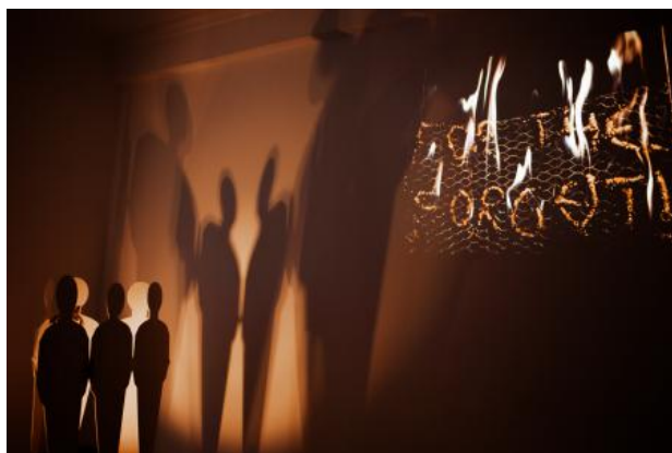
For the, Forget, 2023 Video Installation