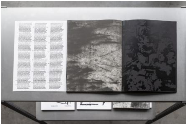
Coal Mine, Land Mine, Body of Mine: book, 2024 silk printing, charcoal ink, digital printing, 210 x 275 x 25 mm