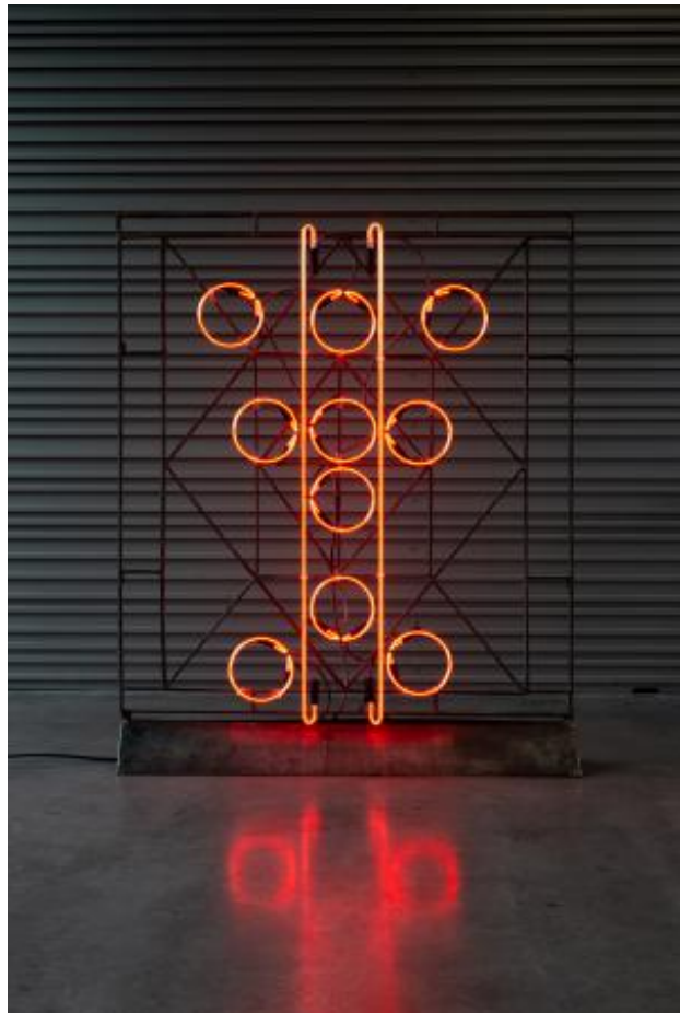
The Portrait, in collaboration with Alexandra Hunts, 2024 Old Ukrainian window grill, steel, neon gas, borosilicate glass, power transformers., 125 x 110 x 15 cm