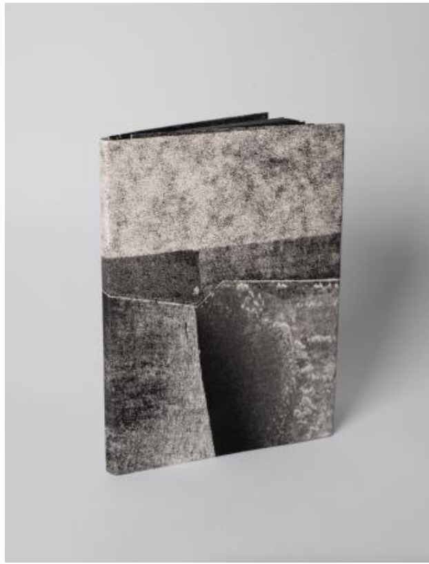
Coal Mine, Land Mine, Body of Mine: book, 2024 silk printing, charcoal ink, digital printing, riso printing, 210 x 275 x 25 mm