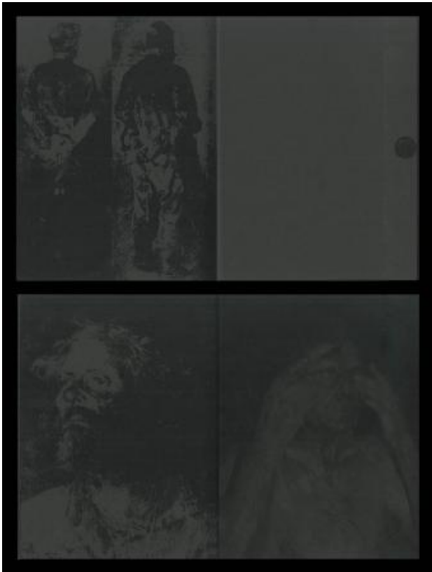
Coal Mine, Land Mine, Body of Mine: book, 2024 Laser print, riso print, silkscreen printing, charcoal, 210 x 275 x 25 mm