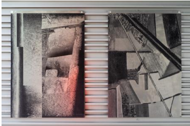
Coal Mine, Land Mine, Body of Mine: Two Landscapes, 2024 silk printing, charcoal, base, metal sheet, 594 x 841 mm, 594 x 841 mm

2021 Holland Scholarship Holland Scholarship The Hague, Nederland