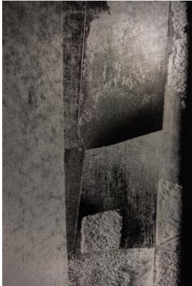
, 2024 silk printing, charcoal, base, metal sheet, 594 x 841 mm, 594 x 841 mm