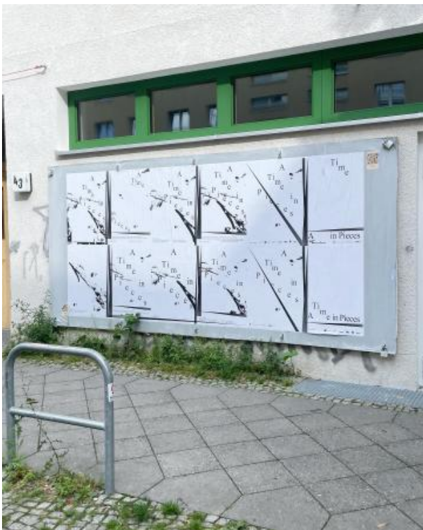
Poster project: A Time in Pieces at Between Bridges, 2024