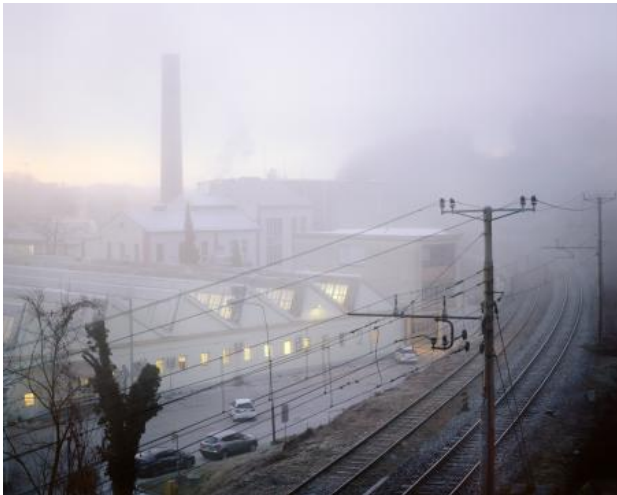
In the mountains, the sun is shining, 2024 Photography