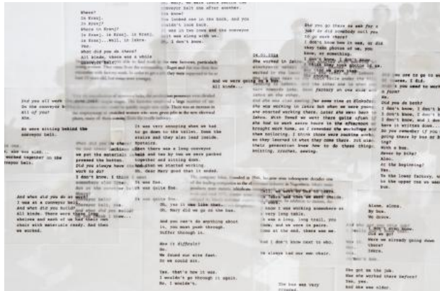
In the mountains, the sun is shining, 2024 Collage