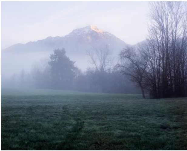
In the mountains, the sun is shining, 2024 Photography