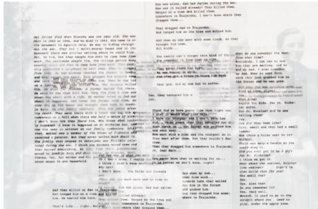
In the mountains, the sun is shining, 2024 Collage