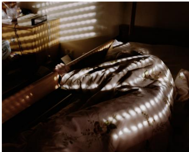
In the mountains, the sun is shining, 2024 Photography