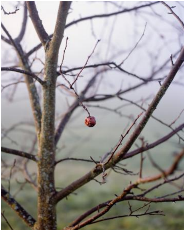
In the mountains, the sun is shining, 2024 Handwritten captions