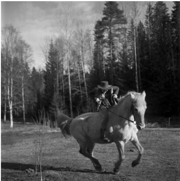
Merja Renz riding her Horse, 2024 Image shot on negative film with Rolleiflex