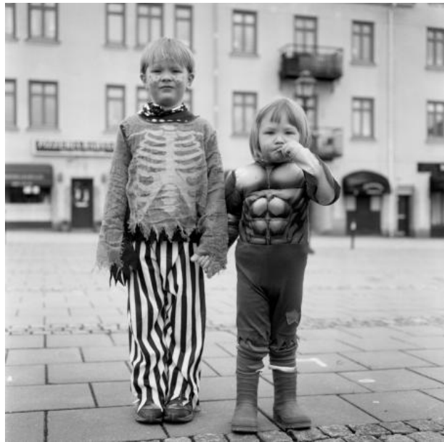
Easter Celebration, Nora, 2024 Image shot on negative film with Rolleiflex