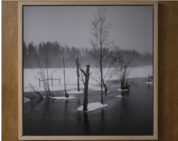
Flooding River, 2024 inkt fotoprint op Bariet papier, Lindt float frame, 1m x 1m

2024 The Sky Is A Hazy Shade Of Winter Boek Wouter van Wessel Den Haag, Nederland Fotoboek van het projekt The Sky Is A Hazy Shade Of Winter.