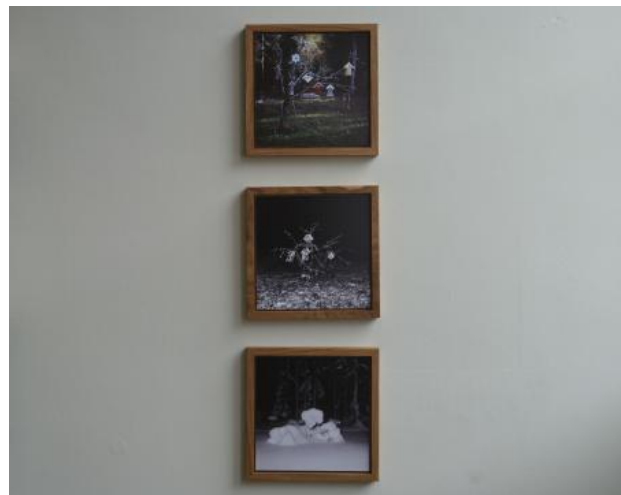
The slow degradation of an Apple tree, 2024 inkt fotoprint op Bariet papier, Eiken float frame, 35cm x 35 cm