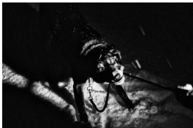
Pulling home , 2020 Digital Photograph taken with Fujifilm S5pro