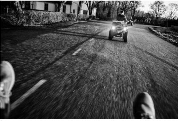
Transportation through the forests , 2020 Digital Photograph taken with Fuji xh-1