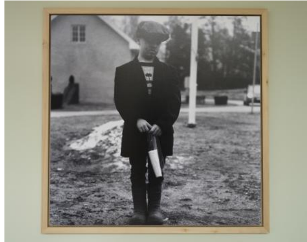
Young boy during easter celebrations, 2024 inkt fotoprint op Bariet papier, Lindt float frame, 1m x 1m