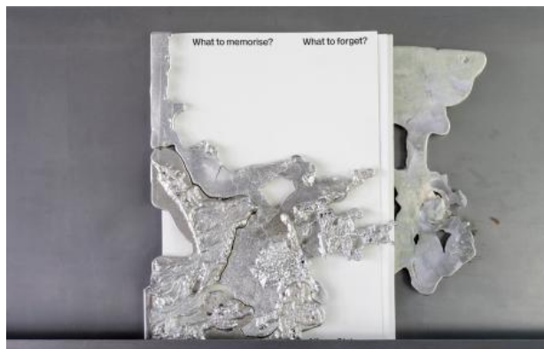
What to memorise? What to forget?, 2024 Aluminium Casting, digital print, 29,1 x 21,4 cm