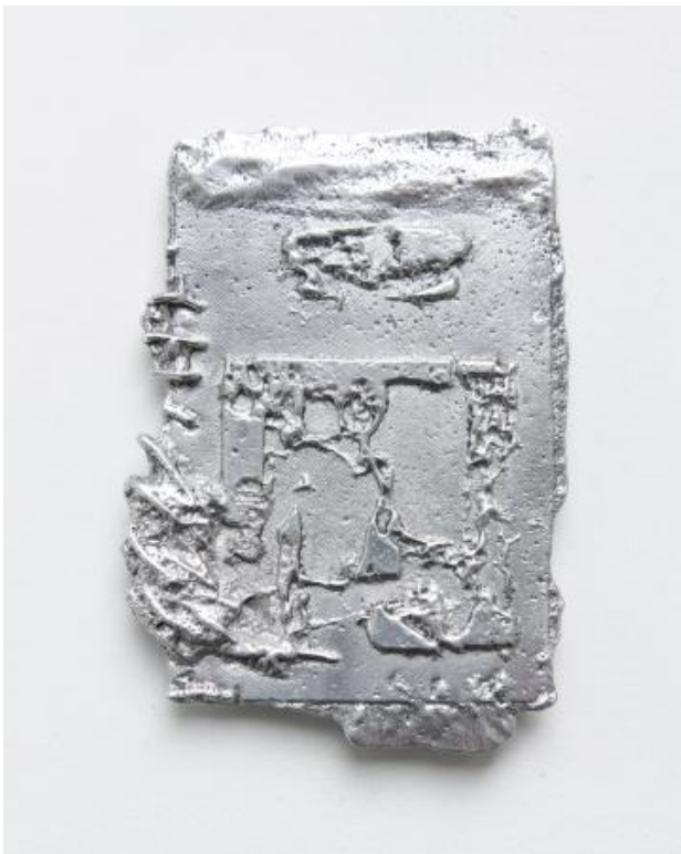
Man eating soup, 2024 Aluminium Casting, 12,6 x 8,8 cm