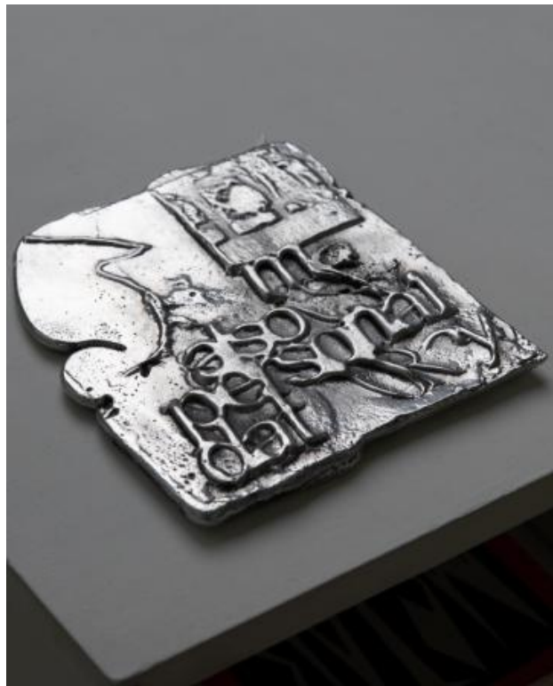
Privacy, 2024 Aluminium Casting, 16 x 14,7 cm