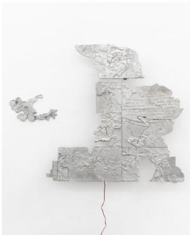
What to memorise? What to forget?, 2024 Aluminium Casting, 100 x 170 cm

environmental challenges Ukraine is currently facing and to place them in a global context. Artistic images, investigative documentations and institutional practices will be explored with regard to possible exit strategies from the current impasse of war, authoritarianism and colonialism, where the scenarios for a new Ukraine beyond war could even be imagined. 2023.kyivbiennial.org/eng/ Uitgevoerd