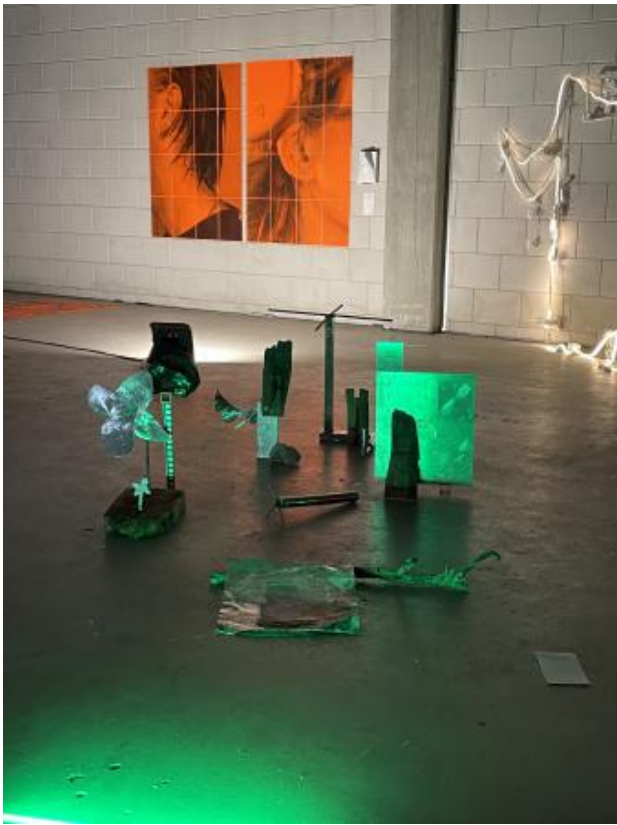
Metal garden, 2023 Wood, metal , 100 x 100 cm