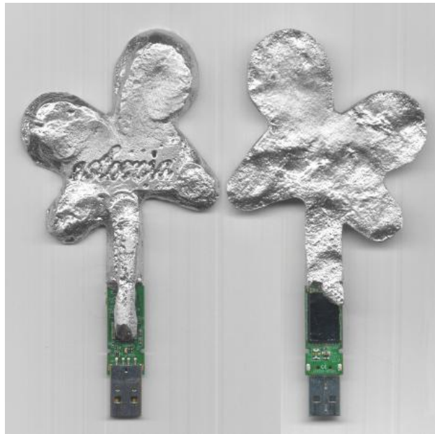
Asthenia, 2023 Aluminium casting, 15 x 8 cm