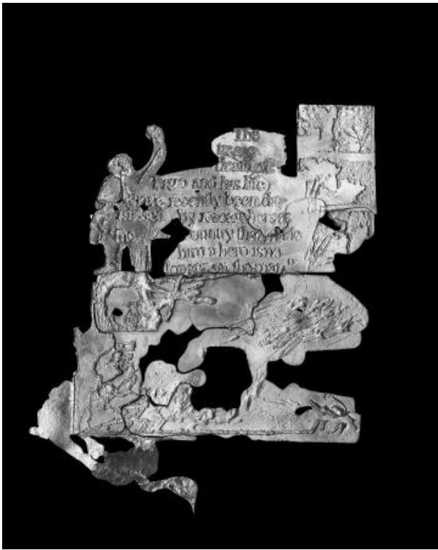
Collapse, 2024 Aluminium Casting, 50,5 x 44,6 cm