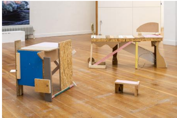
Exchange, 2023 Wood, metal , 150 x 100 x 100 cm