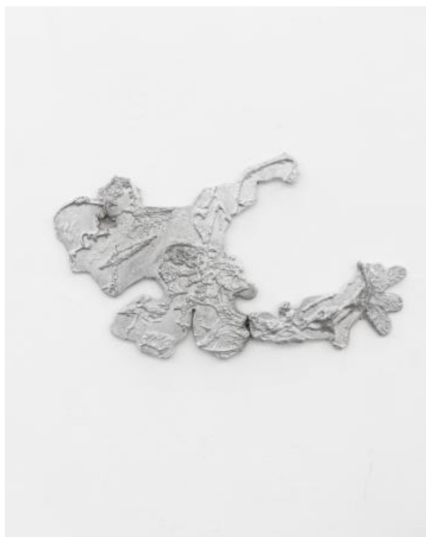
Becoming, 2024 Aluminium Casting, 25,9 x 42,6 cm