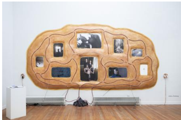
In the softness of the belly..., 2024 Carved Styrofoam frame covered in latex with a PVC pip system pumping "blood" around the frame. Photographs printed on dibond. Ceramics sculpture. Video works. Publications, 6x3x0,15 meters