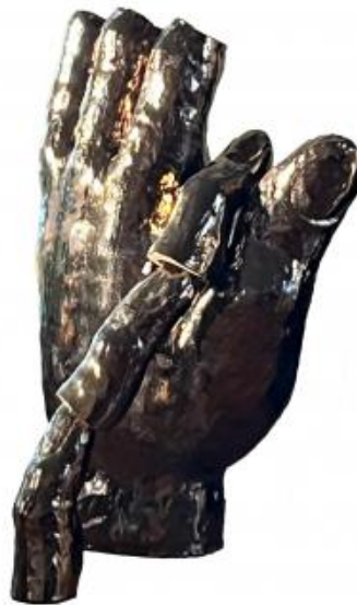
Hand, 2023 Glazed stoneware, 80x50x40cm