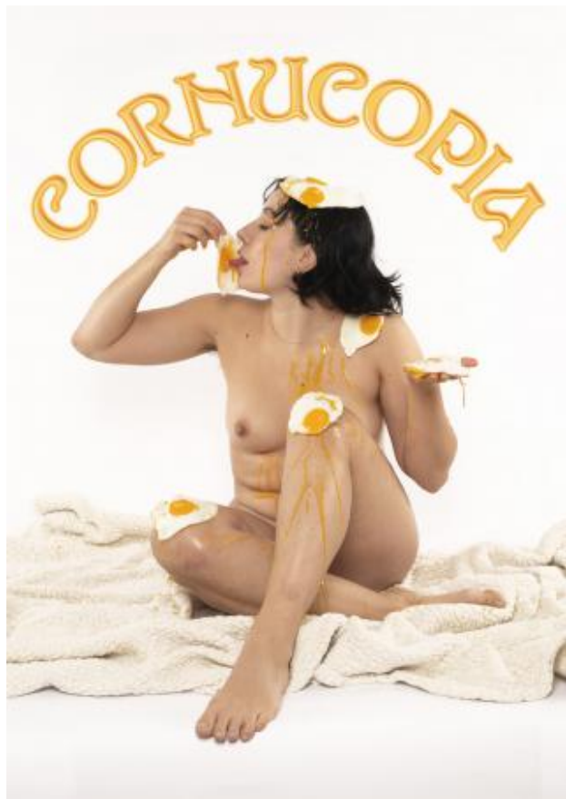
CORNUCOPIA, 2023 Photography. Printed Calendar., 29,7x42cm x 13 pages