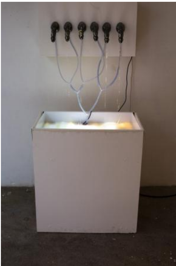
99% Pure Potent Energy, SLURP, SLURP! , 2023 Cast porcelain dicks. Pump system. Installation. Video projection. , 2,5x1x0,8 meters