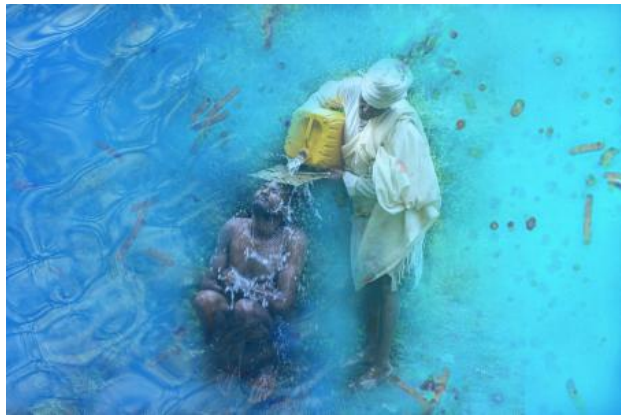
We would have never been there, 2023 Triple exposure Photography

Where is the Bride of the Nile - Cinema - FINAL - SOUND- 15 July , 2024 16