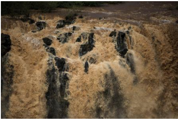
Oh Mysterious Nile, Will you be immortal, 2019 Photography