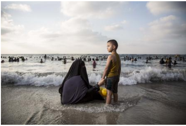
Shaabi Beaches, 2018 Photography