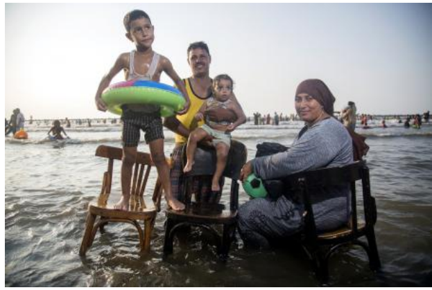
Shaabi Beaches, 2017 Photography