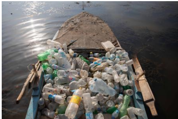
Where is the Bride of the Nile, 2021 Photography