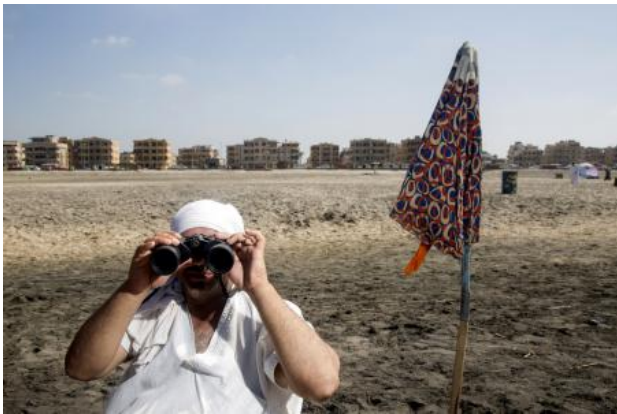
Shaabi Beaches, 2017 Photography