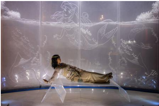
Where is the Bride of the Nile, 2021 Photography