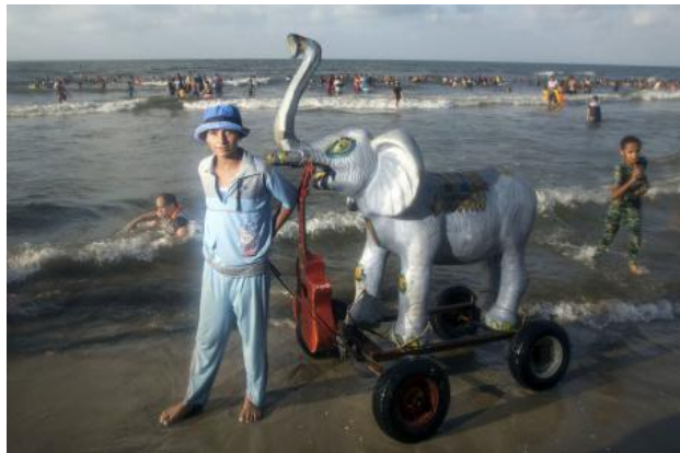
Shaabi Beaches, 2018 Photography